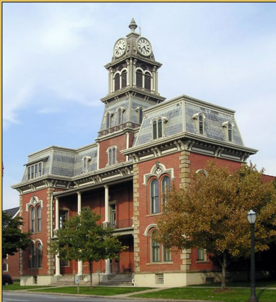
Old Court House Public Square